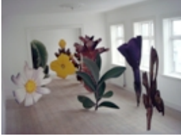
① Hugues Reip 《Eden》 2003 Photo: Hugues Reip