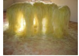
④ Michel Blazy 《Patman10》 2005