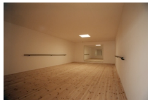
⑩ Rei Naito 《Untitled (passage)》 2007 Collection: Tatsumi Sato