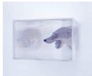
⑪ Kohei Nawa 《PixCell[Coyote]》 2004