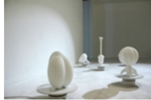
③ Hugues Reip 《Les Pistils》 2007