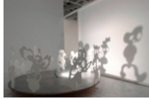
② Hugues Reip 《White Spirit》 2005 Collection Fond National d'Art Contemporain, Paris