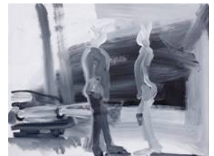
⑫ Alan Séchas 《Foggy Days 4-Rencontre》 2006 © Alain Séchas-ADAGP